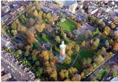
Aerial Photographs – A photograph taken from the sky.