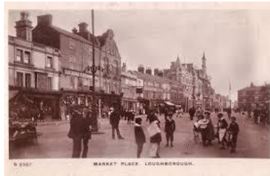
Market Town – Loughborough has had a market in its town centre for over 800 years.