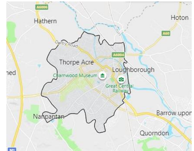
Maps tell us about places. They tell us where places are and help us to identify where things are located. From maps we are able to find roads, schools, and other places of interest. A map uses symbols to show where these places are. These symbols are explained in a key .